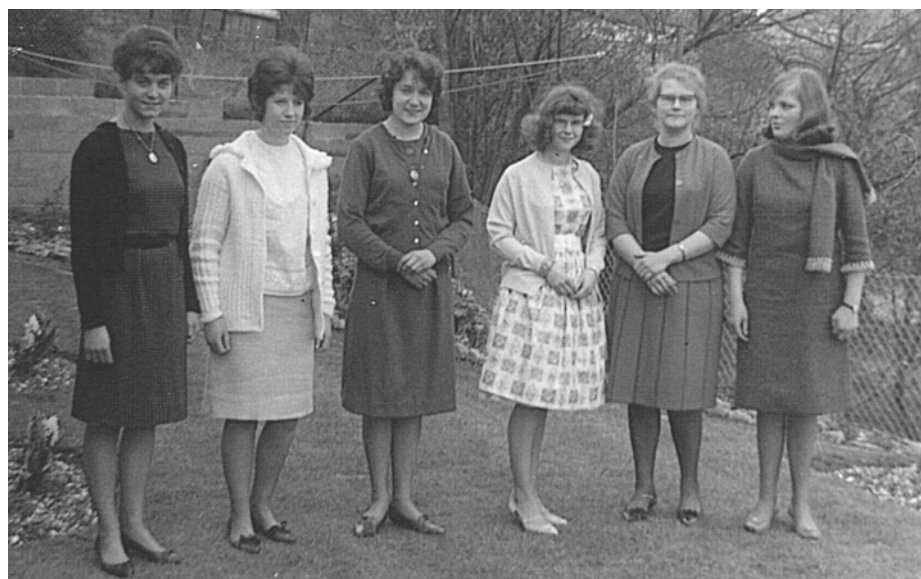
Old Varndeanian Sample