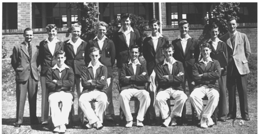
Old Vardeanian Sample